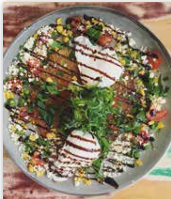
green pea pancake local press @localpresscafe