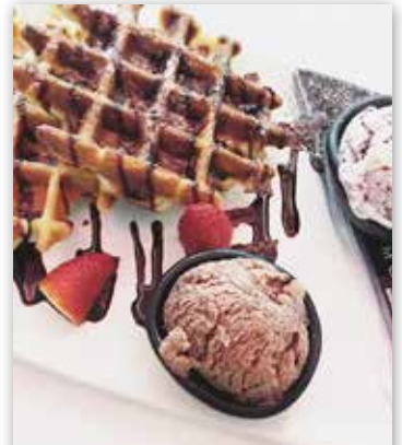
desert for dinner at movenpick by @jessica.peris