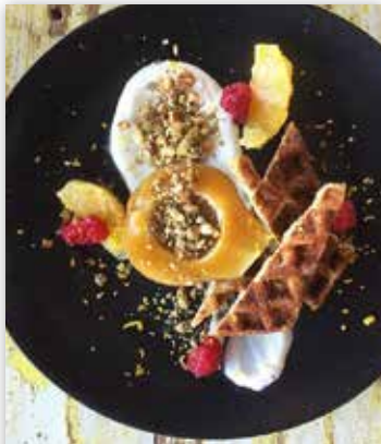
waffles with baked Butterscotch pears, topped with raspberry, orange zest and yoghurt @localpresscafe

There has been an explosion of flavour at the Kingston Foreshore with a number of new restaurants, bars and specialty retailers opening their doors!