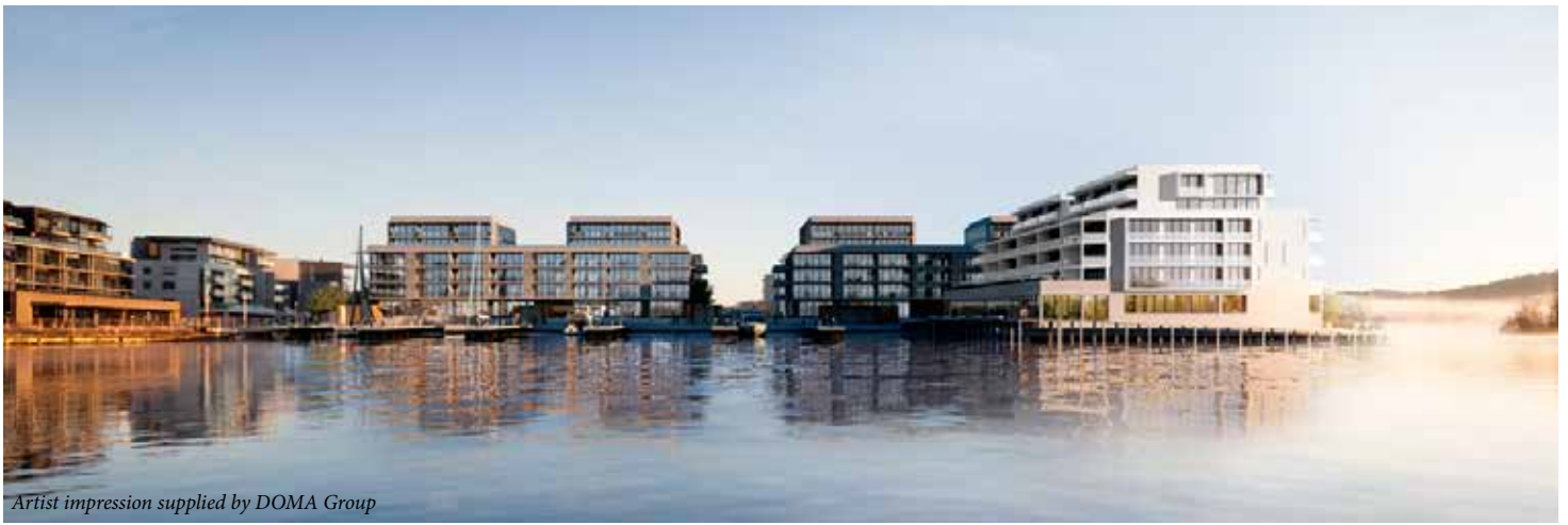
Artist impression