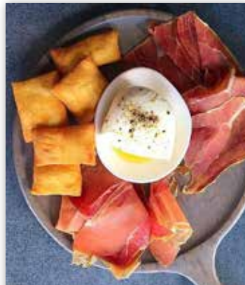
sundays at molto italian by @ediblecities.cbr