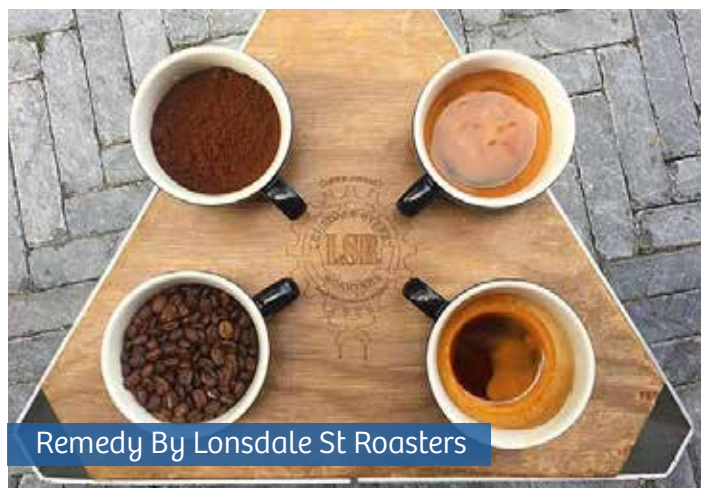
Remedy By Lonsdale St Roasters