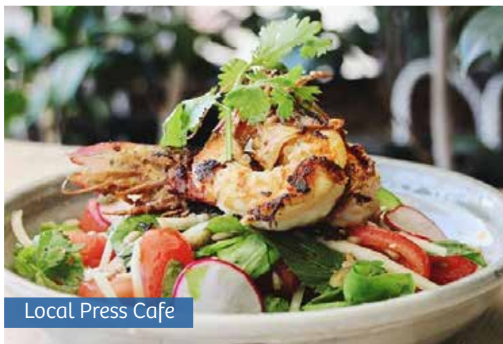
Local Press Cafe