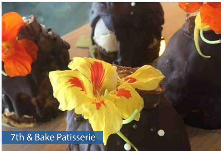
7th & Bake Patisserie