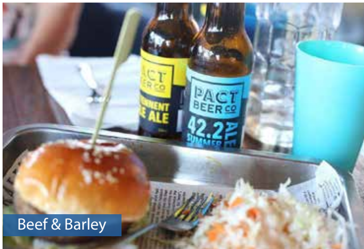
Beef & Barley