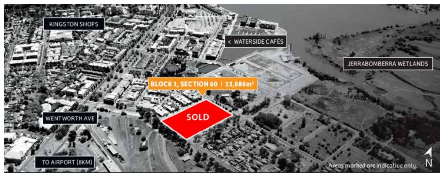
Areas marked are indicative only.

Further information about all Kingston Foreshore developments is available at www.kingstonforeshore.com.au