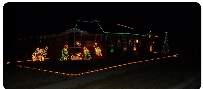
Winning house - 141 Rob Riley Circuit

Thank you to all the Bonner residents who registered for the 2012 Mingle Christmas Lights Competition! There was a fantastic variety of lights, signs and decorations, and all the houses had their own special touches. It was great to see residents embracing the festive season and sharing the joy of Christmas with family and other residents in the community.