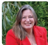
Minister for Homes, Homelessness and New Suburbs