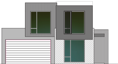
UPGRADE ELEVATION SHOWN